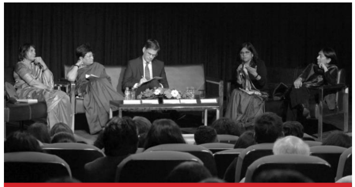
Roundtable on "Literature and Femininity in India and Spain"