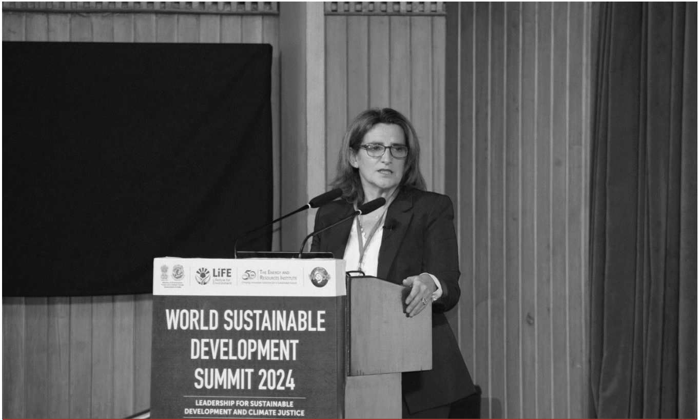
Teresa Ribera, Minister for Ecological Transition and the Demographic Challenges of Spain, at World Sustainable Development Summit in New Delhi